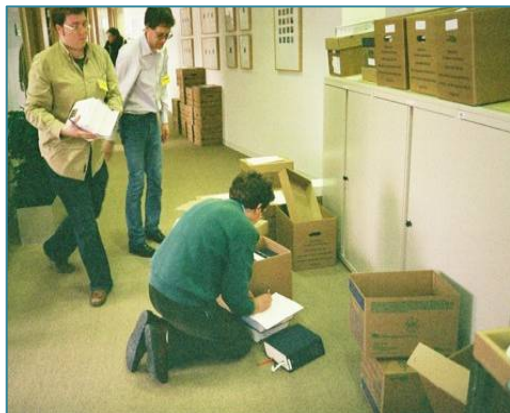
Volunteers at our book repository sort and label books

Donated books are currently stored at Clifford Chance, which kindly donates storage facilities. 10 Clifford Chance employees also spend time sorting through donated books and carrying out administrative tasks.