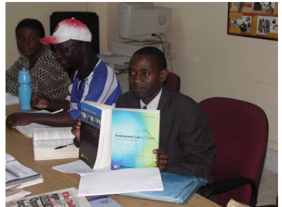
Student lawyers at Malawi Law Society

The ILBF is planning further shipments in 2007 to partners in Uganda, Swaziland and Tanzania. Shipments to Bangladesh, Nepal and Sri Lanka are planned for 2008.